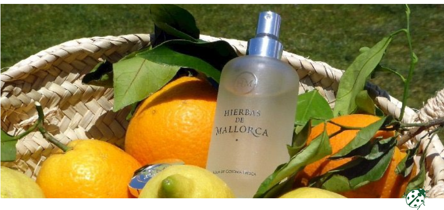
The best source of inspiration is nature