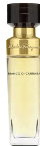
TRAVEL SIZE FRAGRANCE